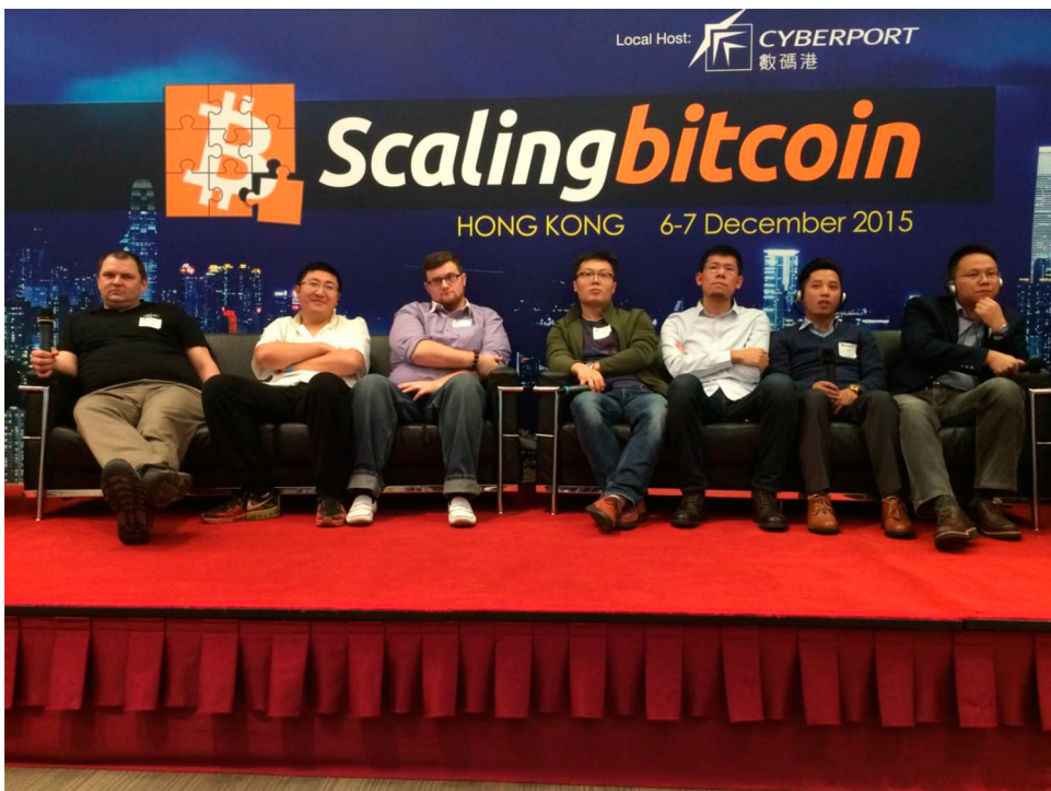
Figure 4. 'can we really say that the uncoordinated choice model is realistic when 90% of the Bitcoin network's mining power is well-coordinated enough to show up together at the same conference?' (Buterin 2017)

The Satoshi Oath further warns, 'If it becomes compulsory to take part in a decentralised system, the system itself becomes an oppressive authority in its own right' (Brekke 2016). Legal scholar Alan Cunningham (2016) contends that the more power blockchain protocols obtain, the less space remains for human agency. Galloway's thesis on the hegemony of protocols, written before Bitcoin