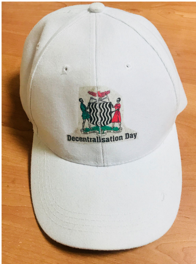
Figure 1. Hat from a 2013 event sponsored by Zambia's central government celebrating a decentralization process.

fostering more responsive political and civic institutions through local accountability (Bonnal n.d. ). The concept has had powerful advocates, but it also finds plentiful critics, who found voice especially through the movement alternately referred to as seeking 'anti-globalization' or 'global justice.'